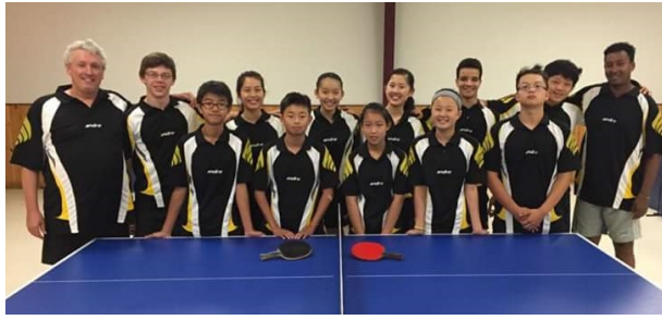
Table Tennis Manitoba is pleased to announce its 12 athlete team heading to Trois Riviere to compete in the 2015 Butterfly Canadian Table Tennis Championships August 25-30, 2015.