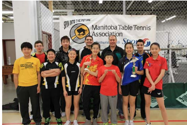
Canada Winter Games Trial #2 - Top 6